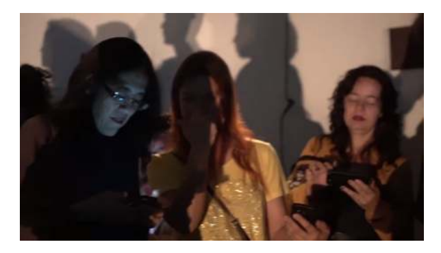
Figure 1: The audience participation during the performance O Chaos das 5

Another performance used mobile phones not only to the audience. Aiming for high-scale musical performances and using mobiles as DMIs, a musical performance called Echobo [5] was developed, which was based on the use of two types of instruments implemented in a smartphone application: one for the maestro and one for the public. The conductor was responsible for defining the progression of chords, which although it does not emit any sound, it is responsible for controlling the harmony of the sounds produced by the public. The public, from the harmonic constraint set by the conductor, can play note by note within the defined harmonic field. The audience studied was between 20 and 120 participants and the feedback received was that when using the Echobo they felt more connected to music and other musicians. That is, the creation of instruments with user-friendly interfaces seems to be a very promising idea regarding public satisfaction.