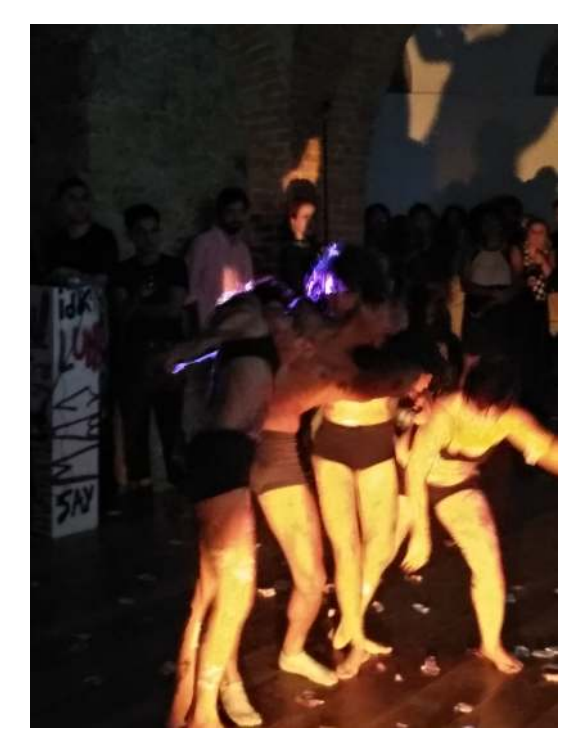
Figure 2: The performers interacting with their own projection in the final part of the performance.

The "Chaos das 5" is an audiovisual digital performance developed by the Transdisciplinary research Group (GTRANS) from the Federal University of São João del-Rei involving the ALICE (Arts Lab in Interfaces, Computers and Else) / Orchidea (Orchestra of Ideas) group from the Computer Science Department and the ECOLAB / Movère group from the Scenic Arts Department.