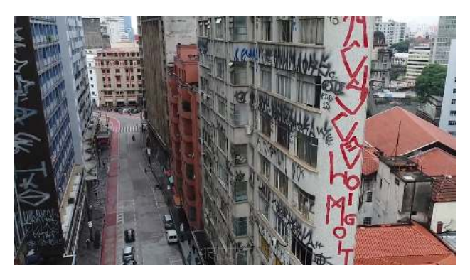
Figure 4: An urban image projected on the second part of the performance.

The free falling finishes in a second part, a disruptive experience in the real world. A territory battle in the city where people try to exist and register this existence guided this part of the performance. We projected a noisy sequence of pictures of graffiti, like in Figure 4, and other urban scenes while a city soundscape completed a saturated urban scene.