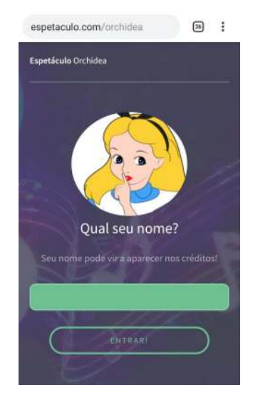
Figure 5: The website's front page.

The website front page asked the audience members' name and gave a few clues to find the key and then they could access a page to select different instruments (Figure 5).